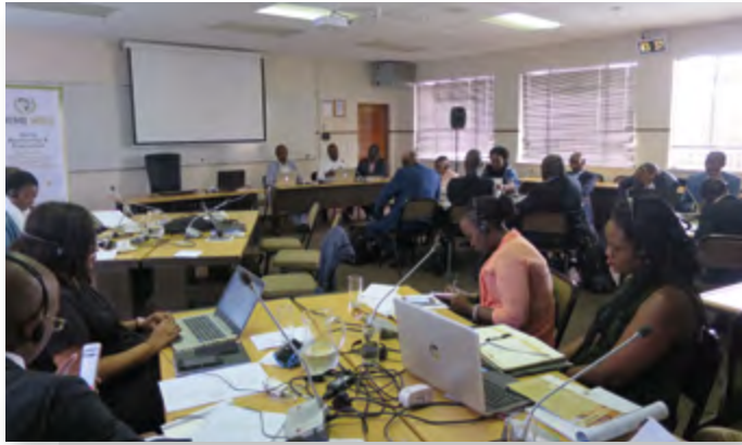
Twende Mbele workshop on national evaluation policies in Johannesburg.

On 23 October 2017, Twende Mbele organized a knowledge sharing workshop on National Evaluation Policies in Johannesburg, South Africa, with the participation of government representatives from 14 countries (Benin, Botswana, Cote d'Ivoire, Ghana, Kenya, Lesotho, Niger, Nigeria, Senegal, South Africa, Tanzania, Uganda, Zambia and Zimbabwe). Presentations from Benin, South Africa and Uganda on developing a national evaluation policy and its content were interspersed with group work in which participants reflected on the situation in their own