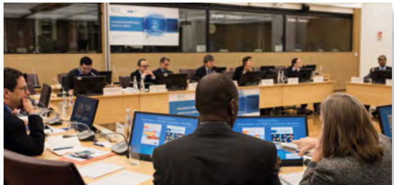
The ECG meeting in Rome

The ECG met on 2–3 November 2017 at the IFAD Headquarters in Rome, Italy to share recent work and exchange views on issues of common interest. Themes discussed included private sector engagement; partnerships; gender; and evaluation for corporate management. IDEV presented its formative evaluation of the AfDB’s human resources policy and strategic directions (see article). Work is ongoing