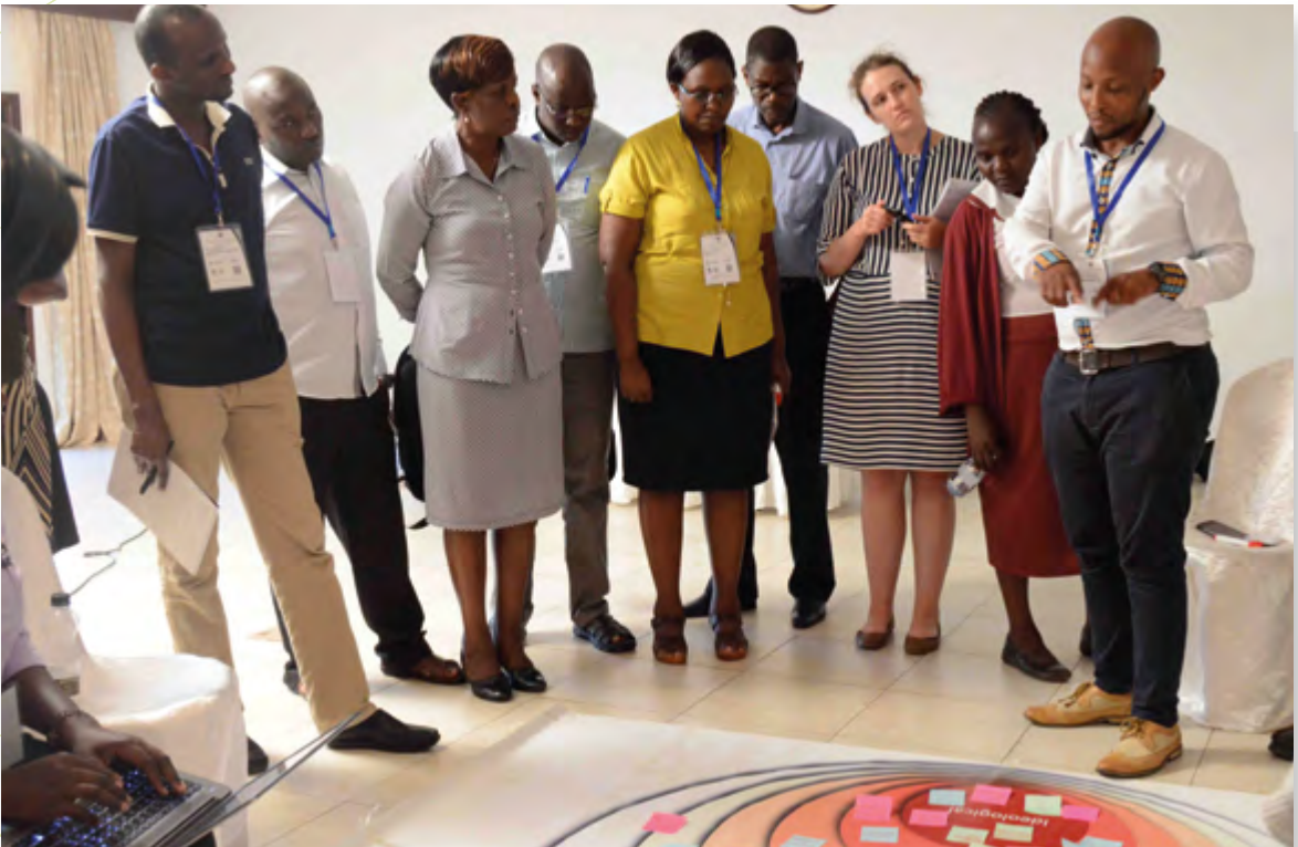
Training session for MPs and government officials at Kenya Evaluation Week 2017.