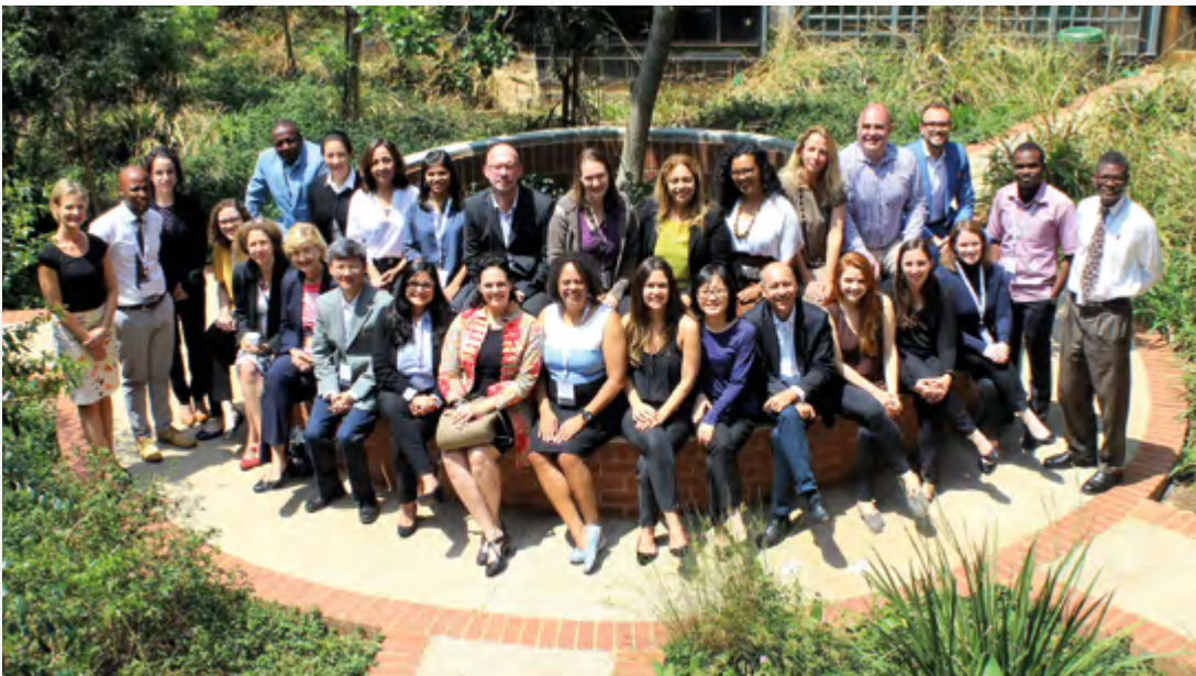
CLEAR participants at the forum in Johannesburg.

and operationalization of the “CLEAR 2021” vision, and the sustainability of the initiative. On the third day of the Forum, Twende Mbele presented its work on South-South cooperation in evaluation, in view of starting a knowledge-sharing dialogue between regions.