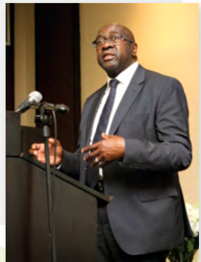
Nhlamhla Nene, former Minister of Finance of South Africa and keynote speaker at the PSD event in Pretoria.

More than 70 representatives from the private sector, governments, multilateral agencies, regional and sub-regional development banks, development institutions, academia, civil society, and the media from across the continent gathered in Pretoria, South Africa to participate in a two-day knowledge sharing event hosted by IDEV and the Evaluation Department at Norad (NoradDev).